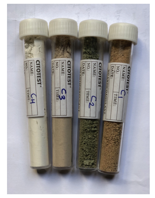
Fig. 1. The external view of the clay samples; C1 clay from Iraq, C2 clay from Turkey, C3 clay from Azerbaijan and C4 clay from Russia.

Table 1 shows the effects of different treatments on the percentage of wound healing at different days after surgery, at day 0 no significant difference was found between groups that shows the accuracy of the work whereas significant results were found on day 5 of the treatment in which C1 and C3 clays showed wound closure percentage of (48% and 45%), respectively, which are comparable to MEBO group (43%). Moreover, remarkable results were observed at day 10<sup>th</sup> of the surgery in which the wound closure percentage were (76%, 60%, 71%, and 62%) for C1, C2, C3, and C4 groups, respectively. The C1 and C3 group's results were better than the MEBO control group (64%). These results confirmed macroscopically (as shown in Fig. 2), as seen groups C1